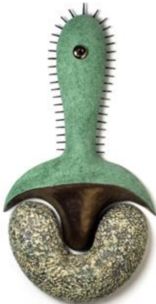
Collected by Guangzhen Zhou